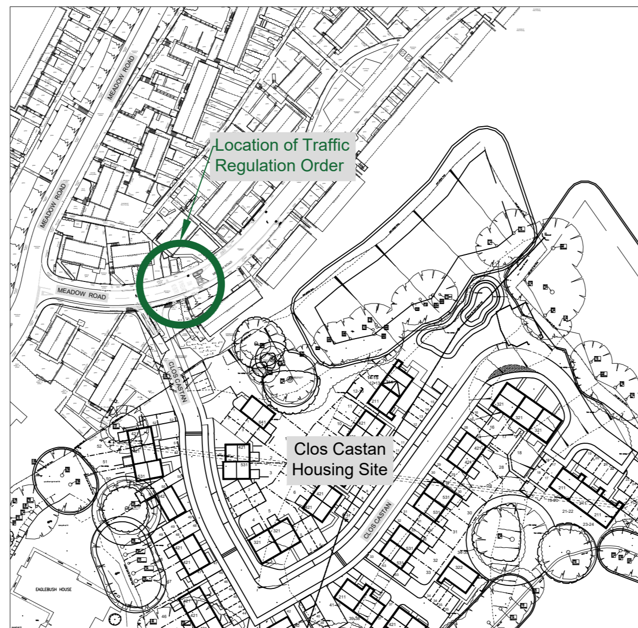
SITE LAYOUT PLAN - SCALE 1:1250